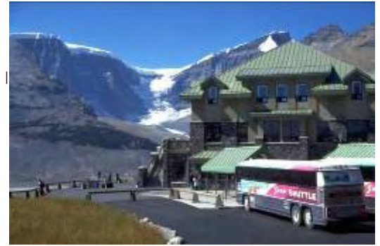
Icefield Centre at Athabasca Glacier

Day 4 Banff - Jasper. Take the 93A towards the Icefields Centre at the Athabasca Glacier, you will see many viewpoints, all are spectacular. Especial & Peyto Lake. At Saskatchewan River Crossing turn off onto Highway 11 to the Icefield Helicopter Tours* , Cline River helipad. Take that picnic lunch on a special treat add on, to any sightseeing flight, for a one hour stopover on any alpine lake or ridgeline. Finally drive onto the Athabasca Glacier and explore the Icefield Centre. At your leisure drive onto the townsite of Jasper. Overnight Jasper.