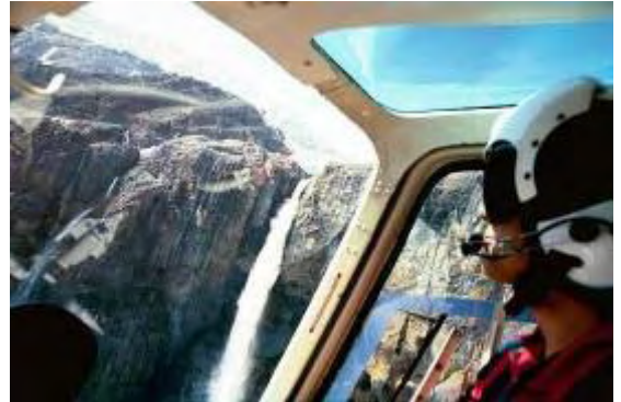
Icefield Helicopter Sightseeing

Day 5. Banff - Jasper. Take the 93A towards the Icefields Centre at the Athabasca Glacier, you will see many viewpoints, all are special miss Bow Summit & Peyto Lake. At Saskatchewan River Crossing turn off onto Highway 11 to the Icefield Helicopter Tours , Cline River helipad. Take that picnic lunch on a special treat add on, to any sightseeing flight for a one hour stopover on any alpine lake or ridgeline. Finally drive onto the Athabasca Glacier and explore the Icefield Centre. At your leisure drive onto the townsite of Jasper. Overnight Jasper.