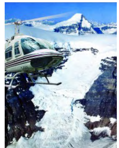
Icefield Helicopter Tours

Day 3. Banff - Jasper. Take the 93A towards the Icefields Centre at the Athabasca Glacier, you will see many viewpoints, all are spectacular. Especially Lake. At Saskatchewan River Crossing turn off onto Highway 11 to the Icefield Helicopter Tours *, Cline River helipad. Take that picnic lunch as a special add on to any sightseeing flight for a one hour stopover on any alpine lake or ridgeline. Finally drive onto the Athabasca Glacier and explore the Icefield Centre. At your leisure drive onto the townsite of Jasper. Overnight Jasper.