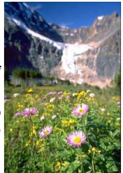
Mt Edith Cavell