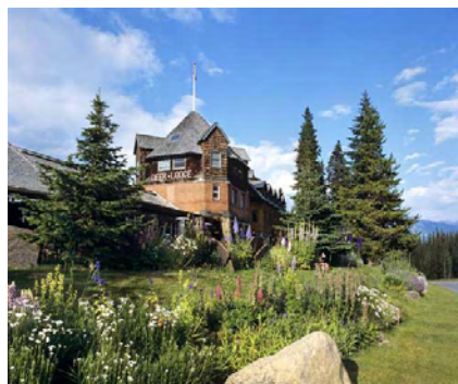
Deer Lodge Lake Louise

Banff Caribou Lodge Banff Ptarmigan Inn Brewster's Mountain Lodge Deer Lodge—Lake Louise Lobstick Lodge—Jasper Delta Lodge at Kananaskis