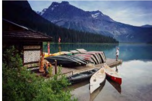
Emerald Lake, Yoho National Park