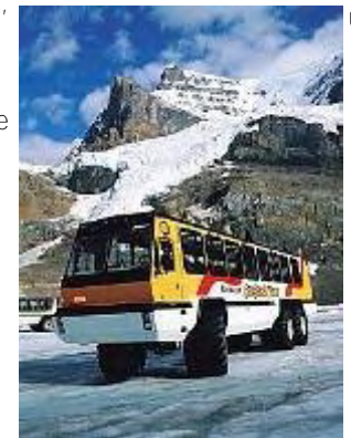
Ice Explorer Tour

Day 4. Banff. A free morning to take the Banff Gondola* for a final view of Banff, visit the Cave and Basin* historical site, a museum, art gallery or just shop for souvenirs along Banff Ave.