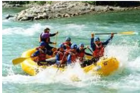
Whitewater Rafting Jasper

driving out to Miette Hot Springs* at dusk, where you may view wildlife along the road. Drive slowly and carefully. Overnight Jasper.