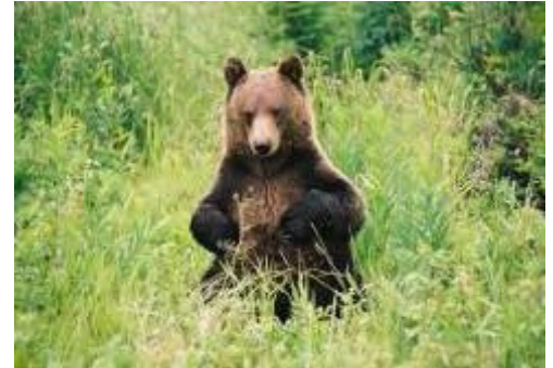
Grizzly Bear Refuge

Day 8. Emerald Lake, Spiral Tunnels, Grizzly Bear Refuge. Drive west on Highway 1 first stopping at Spirals Tunnels and watch for trains making the loop through the tunnels. Continue onto to Emerald Lake and hike around the lake (~2hr), peering up towards the Burgess Shale (UNESCO World Heritage restricted site), remembering that all this was once the sea bottom. Continue onto the Town of Golden and Kicking Horse Mountain Resort. Enjoy the gondola ride, sky lunch at Eagle's Eye Restaurant for orphaned cubs*. Overnight Lake Louise.