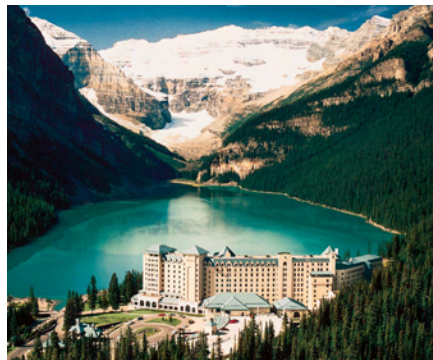
Fairmont Chateau Lake Louise

Banff Accommodation Reservations reserves the right to offer alternative properties of equivalent or higher standard to those listed. Price modifications may apply if this occurs.