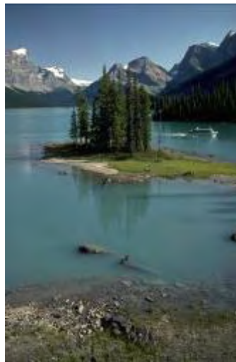
Maligne Lake Cruise

Day 5. Jasper. Drive out to Maligne Canyon (about 15 mins east of Jasper) and hike the 3.7 km interpretive trail with foot bridges over and around the canyon. Continue driving to Maligne Lake, whose beauty is legendary. Take the 90min boat cruise* with guided commentary (departs every hour in summer) and enjoy a short walk around the famous Sprit Island. Finish the day by driving out to Miette Hot Springs at dusk, where you may see wildlife along the road. Drive slowly and carefully!