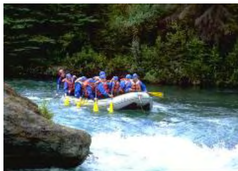
Whitewater Rafting in Kananaskis

Day 3. Whitewater Rafting. Whitewater rafting has become the pre-eminent summer outdoor activity in the Canadian Rockies. A perfect day excursion for visitors seeking some excitement in the Canadian outdoors. Just about everyone can raft, there are a number of areas and levels suitable for all ages.