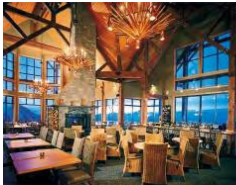
Kicking Horse Mtn Resort

Day 8. Emerald Lake, Spiral Tunnels, Grizzly Bear Refuge. Drive west on Highway 1 first stopping at Spirals Tunnels and watch for trains making the loop through the tunnels. Continue onto to Emerald Lake and hike around the lake (~2hr), peering up towards the Burgess Shale (UNESCO World Heritage restricted site), remembering that all this was once the sea bottom. Continue onto the Town of Golden and Kicking Horse Mountain Resort. Enjoy the gondola ride, sky lunch at Eagle's Eye Restaurant for orphaned cubs*. Overnight Lake Louise.