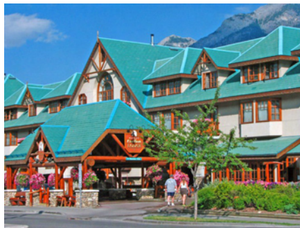
Banff Caribou Lodge

Fairmont Banff Springs Hotel Fairmont Chateau Lake Louise Fairmont Jasper Park Lodge Rimrock Resort Hotel Delta Lodge at Kananaskis